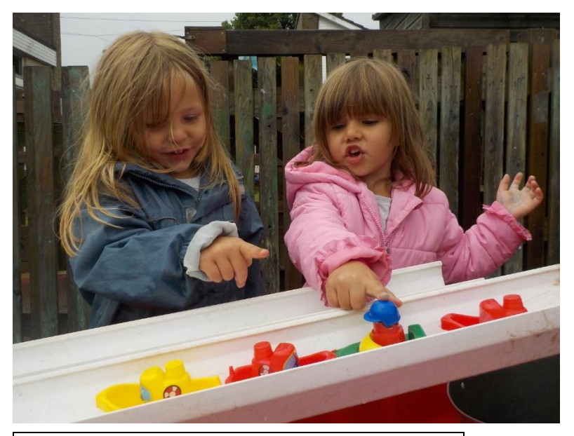
Counting to four is fun when the targets are moving